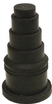
Figure 4.5. Streetlight Tap Cover

Streetlight tap covers shall have a nominal height of 2-1/2 inches.