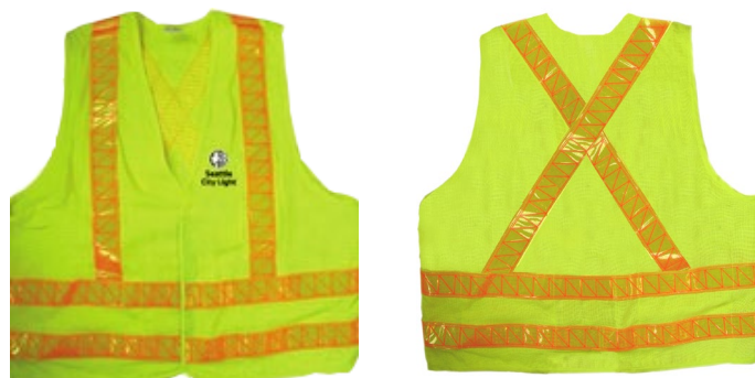
Figure 4.1. Front and Back of Safety Vest

Garment design shall follow ANSI/ISEA 107-2015, Appendix C - Examples of Garment Designs, Figure C-6, Vest Pattern 3 and Figure 4.1.