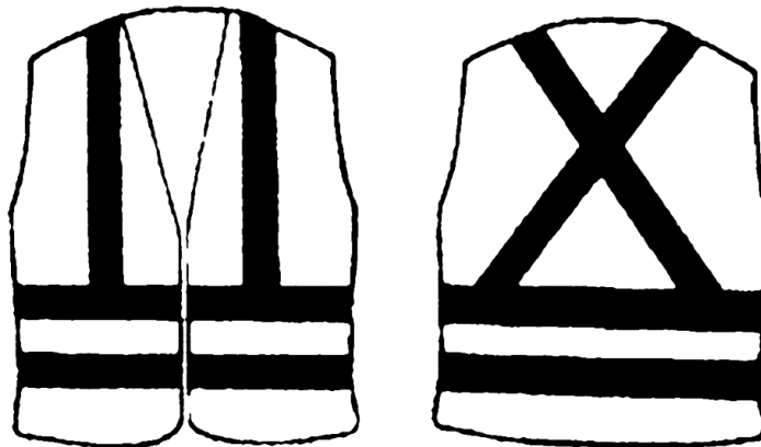
Figure 4.4. Vest Pattern 3 (Performance Class 2), ANSI/ISEA 107-2015

Retroreflective tape shall be FR rated, with the following attributes: