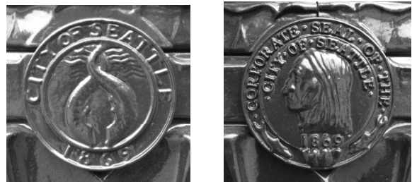
Figure 4.5. Medallions

Like designs shall be installed on faces opposite from each other.