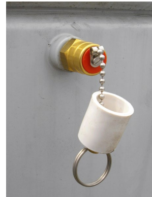
Figure 6.7, Pressure relief valve

A pressure relief valve shall be provided per SCL 4480.10 and IEEE C57.12.20, Section 7.2.5.1 with the following clarifications: